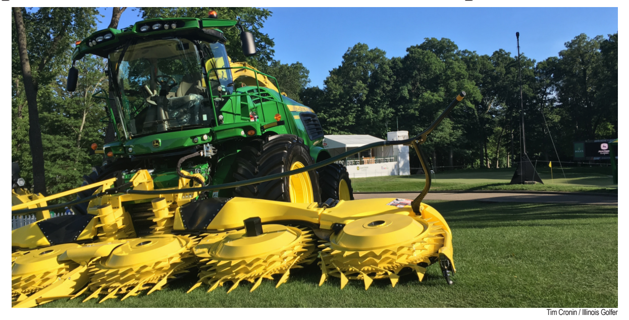
THE SHOWROOM Some of Deere's more specialized products are on display near the ninth green.

Look at this week's John Deere Classic roster. and it's the closest thing to a college tournament