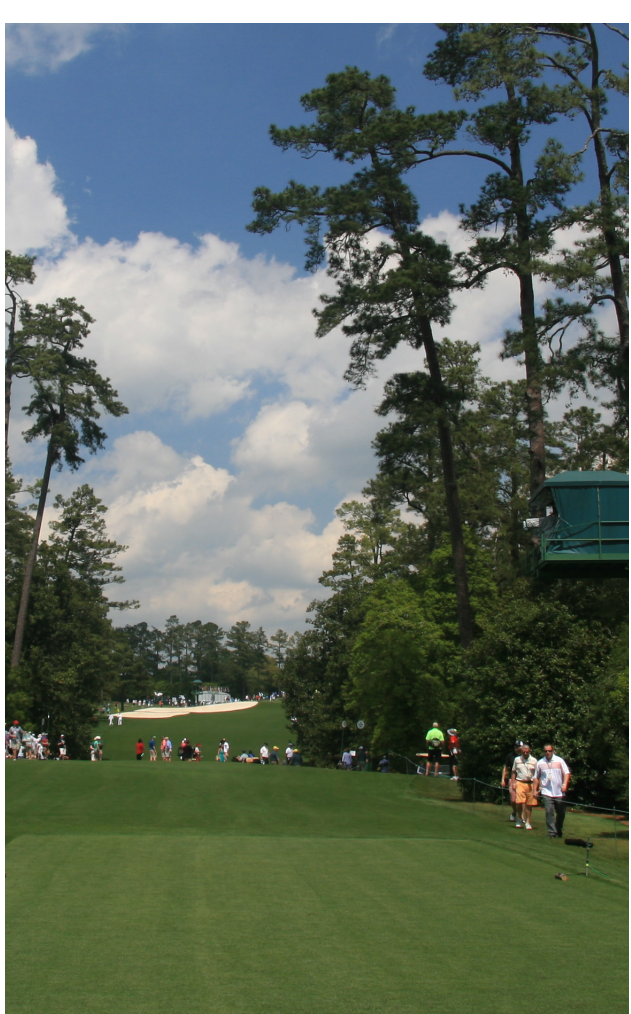
DOWN THE BARREL The tee shot on the par-4 18th, one more familiar than others in this essay, is similar to the 11th in that trees on either side force a relatively straight shot. The tournament tee was pushed back some 50 yards in the lengthening of the course, putting the lip of the first fairway bunker 298 yards away. The tee had been almost equal with the TV camera platform covering the 17th hole.