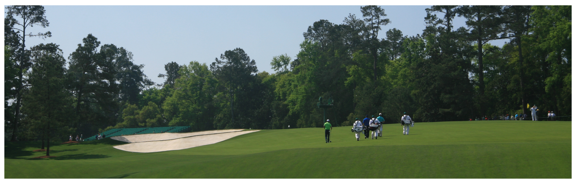
THINK BIG The scale of the Augusta National Golf Club is astonishing. Above is the fifth fairway as seen from the tee. The near edge of the first of two bunkers on the left is 277 yards from the tee, and could swallow up the players and caddies traipsing along. Farther to the left is a huge dropoff. Hook one off the tee on this dogleg on one of the first two days, and you're in what is unaffectionately called the Delta Air Lines reservation center.