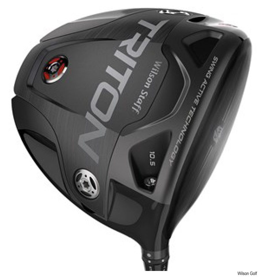
TRY TO FIND ONE The original Wilson Staff Triton driver, which the USGA decided did not conform to the Rules of Golf for arcane engineering reasons.

Every Triton driver on sale now (at about $450) is conforming.